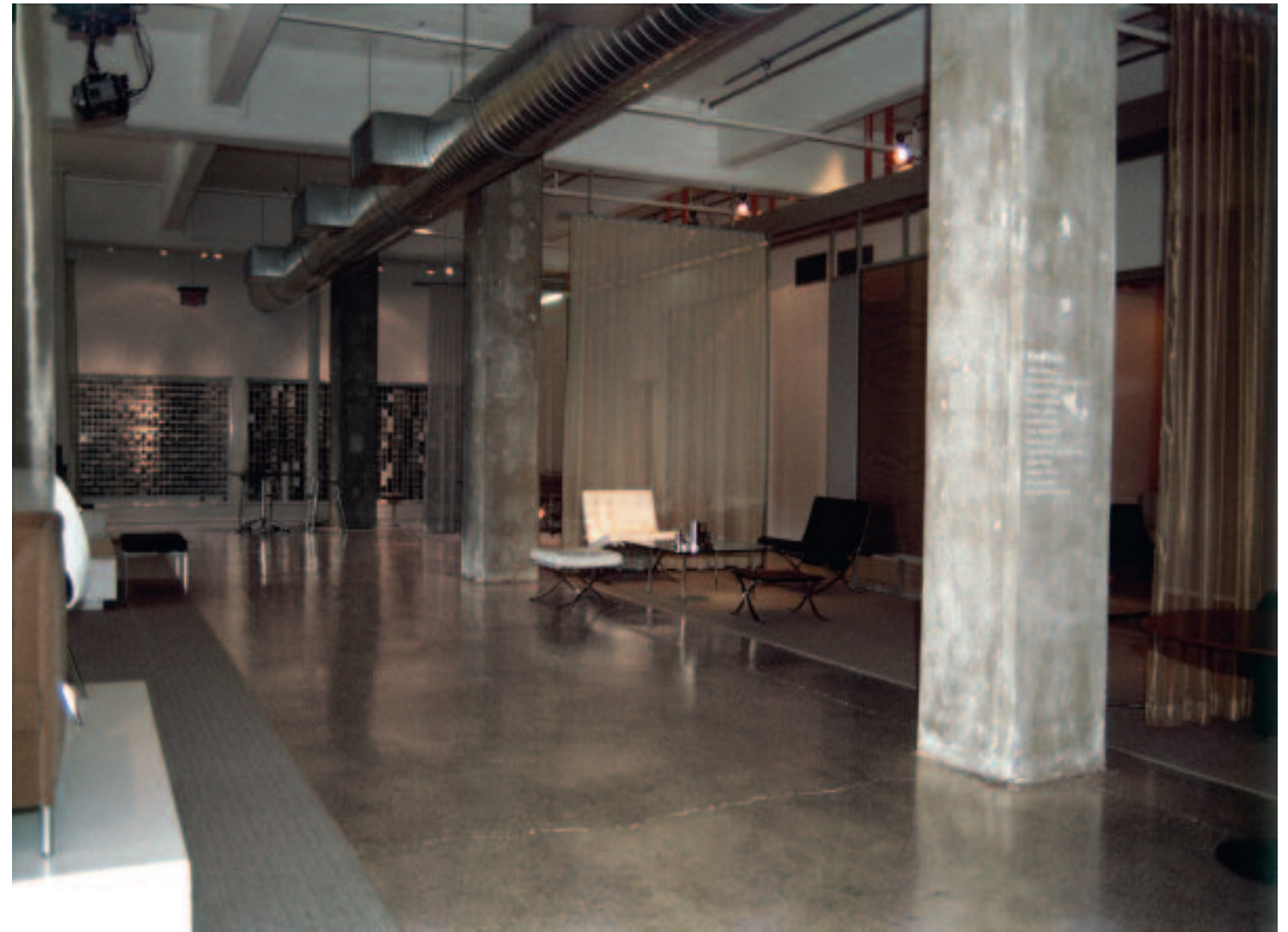
KNOLL New York, NY Polished Concrete

american blast clean concrete restoration, inc. www.amblastclean.com P.O. Box 634, Hawthorne, NJ 07507 ph:973.423.0888 fx:973.423.0653