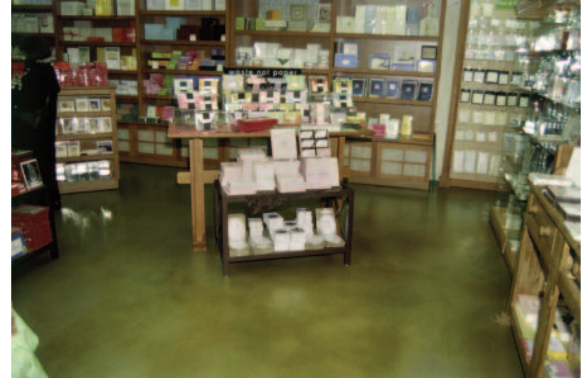
Kate's Paperie, New York, NY Stained Concrete