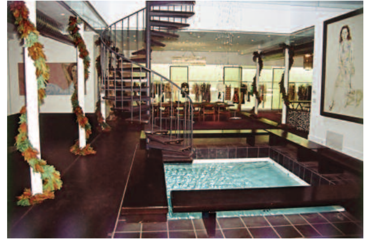
Diane Von Furstenburg, New York, NY Stained Concrete