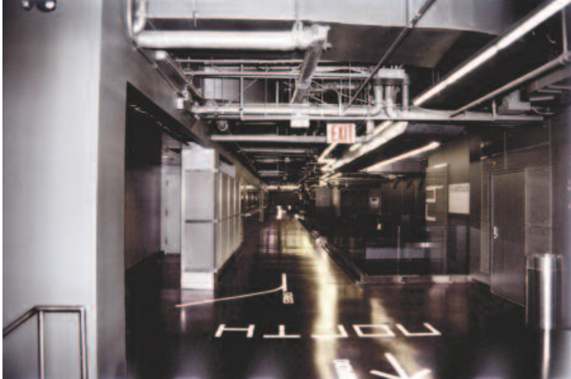
Dodger Stages, New York, NY High Traffic Epoxy